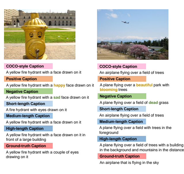
Figure 3: Image captioning examples from COCO (Karpathy and Fei-Fei 2015) with different styles including COCOstyle [], Positive [], Negative [], Short-length [], Medium-length [] and High-length [].

Results on COCO (Lin et al. 2014). In Figure 3, we exhibit the captioning results on the COCO dataset. By feeding different prompts, our ConCap method is able to generate diverse captions including COCO-style [], Positive [], Negative [], Short-length [], Medium-length [], and High-length []. Besides, we observe that the percentage of emotional captions is only about 2% of the entire COCO dataset. The proposed ConCap merely utilizes limited positive or negative captions in COCO to learn such styles. This is consistent with the observation that prompt learning is suitable for few-shot domain transfer (Liu et al. 2021). As shown in Figure 3, our ConCap is able to briefly describe an image or in a more detailed manner. The high-length captions [] produced by our ConCap are much longer than the ground-truth captions and yield additional